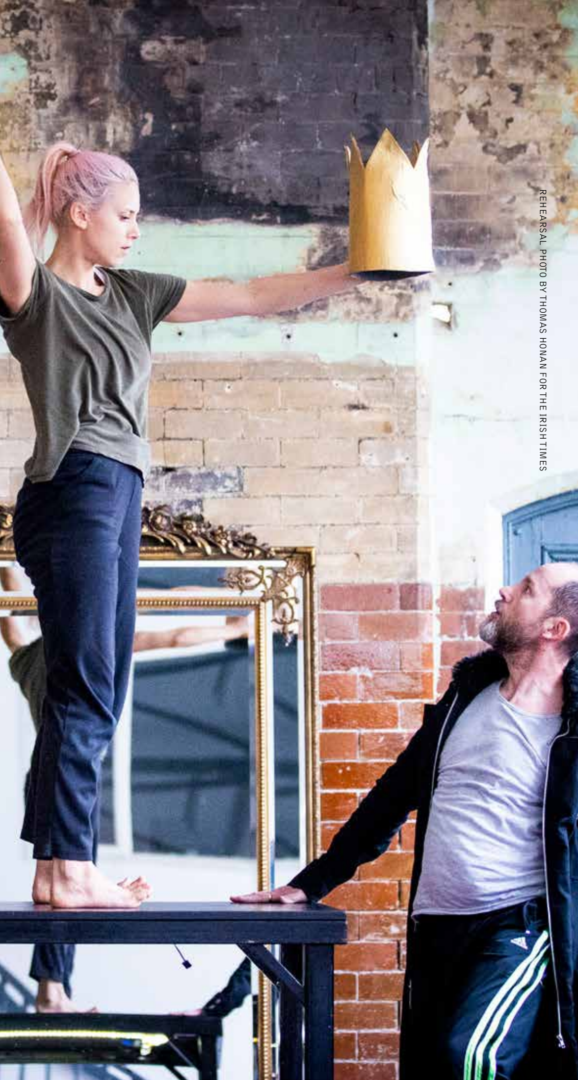
REHEARSAL PHOTO BY THOMAS HONAN FOR THE IRISH TIMES