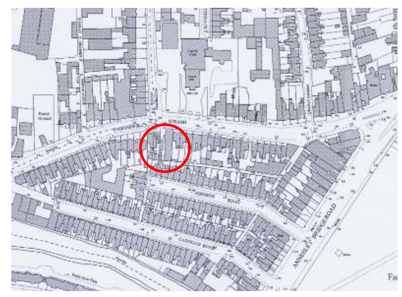
Figure 7/30 – Fairview Former P.O., 1889; Base Map Source: Ordnance Survey Ireland<sup>295</sup>

This former post office building is located on the south side of Fairview Strand opposite the junction of Philipsborough Avenue, Figure 7/30 and 7/31. It is a detached building located between a row of terraced two storey brick houses to the east side and two semi-detached two-storey shop units, of a later period, to the west side.