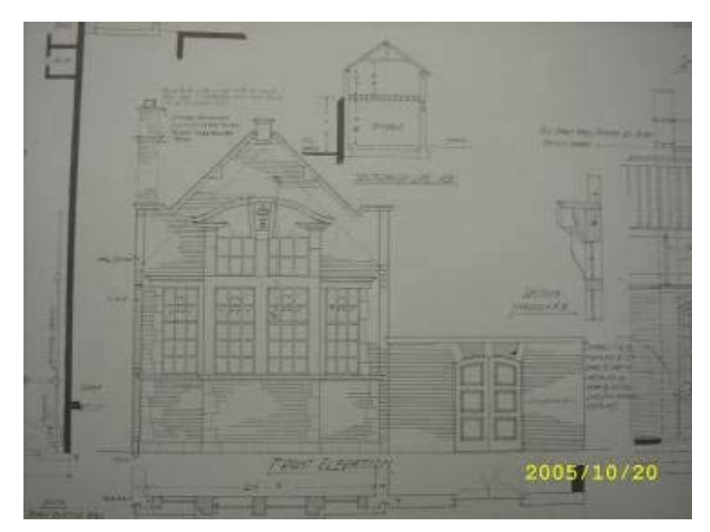
Figure 7/33 – Fairview P.O., c. 1889; Original Front Elevation Drawing<sup>297</sup> Windows, Doors and other features

The front façade differs from the original elevation drawing as the brickwork below the front windows is now stone, Figure 7/33.