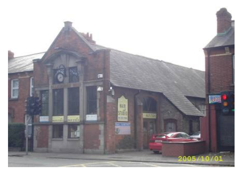
Figure 7/31 – Fairview Former P.O., c.1889; Photo, Author, 2005